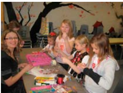
Saskatoon Polish School Fundraiser

SOHL is always interested in finding people who would like to be guests on the program. If you would like to share some interesting points about your organization or travels, or to promote an event, please contact the SOHL office at 306.780.9478 or sohlcoordinator@sasktel.net .