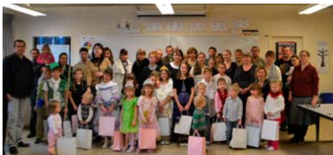
Regina Russian School Christmas Concert